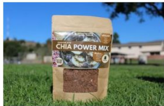
Heavenly Chia Chocolate Chia Power Mix $9.00