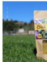
Heavenly Chia Turm Chia Power Mix $9.00