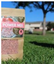
Strawberry Coconut Chia