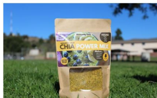
Heavenly Chia Turmeric Golden Milk Chia Power Mix $9.00